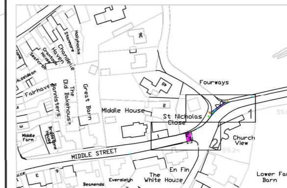
LOCATION PLAN NTS